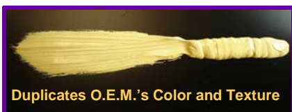
Duplicates O.E.M.'s Color and Texture